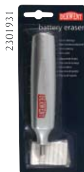
Battery Eraser + erasers