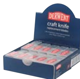
2301936 Replacement Blades (5 blades per box)