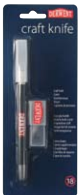
2301932 Craft Knife + 6 blades