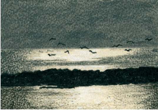
Migrating Birds (Finished drawing 6" x 4")

The freedom of charcoal with the control of a pencil