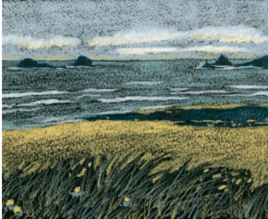
Coastal View (Finished drawing 5" x 8")