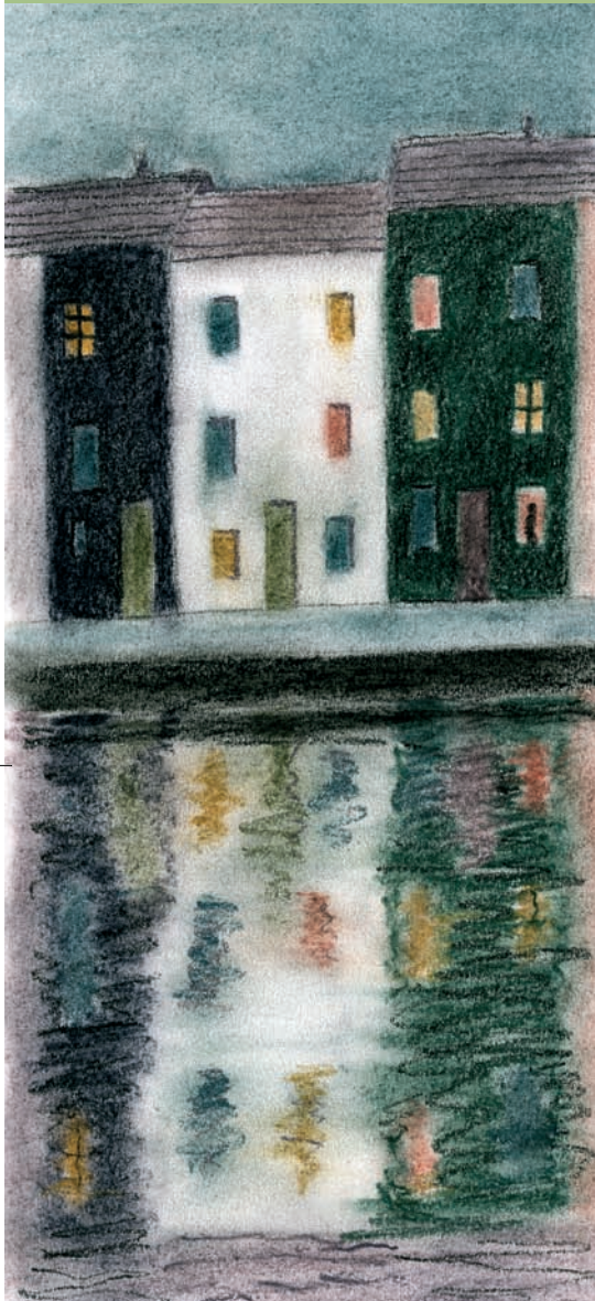
Reflected Buildings (Finished drawing 15" x 32")

All the drama of charcoal, now with colour